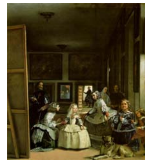
Las Meninas (Maids of Honour) 1656-57. Museo del Prado, Madrid