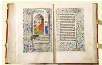
The Sobieski Book of Hours, c.1420-5

http://www.royalcollection.org.uk/default.asp?action=article&ID=21 .