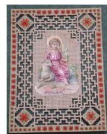
Example of a devotional print

Although we have nearly finished packing each print, we still have to number all those without a number and then last but not least, we will have to classify them all. In the meantime Gilberte and one of the other volunteers are checking again all the pictures on glass in order to complete the information needed for the inventory.