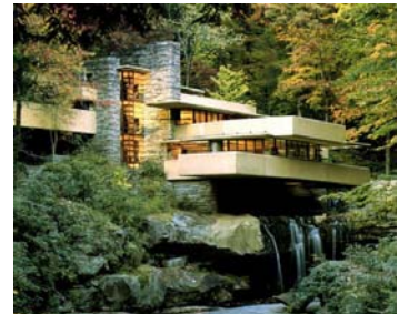
Falling Water, Ohiopyle, Pennsylvania (designed by Frank Lloyd Wright in 1936 and completed the following year)