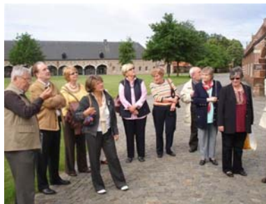
ADFAS group inside the Abbey close

A group of 14 people, members and friends, had a guided tour of the Abbey of Tongerlo. Our English-speaking guide (from the tourist office in Westerlo) was not the best. There was little structure in his explanations and he had problems finding his words, it was not easy to listen to him. Nevertheless the large inner close of Tongerlo's Abbey was on that calm sunny morning inspiring. The story of the Abbey, founded in 1128 in honour of the Blessed Virgin, is complicated. From very small beginnings the abbey grew to be in time one of the most important in Belgium, making its spiritual and social influence felt all over the "Kempen". First the Calvinists and later the French Revolution brought an end to its high days of this Norbertine Abbey. Buildings were demolished, others added and even the Church was rebuilt in a different place.