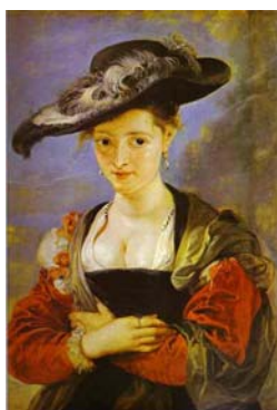
'Le Chapeau de Paille' by Peter Paul Rubens

Housed in a building known as the National Gallery, in Trafalgar Square in London, the collection is not as large as that in the Louvre, the Hermitage or the Metropolitan Museum of Art in New York and nor is it fully inclusive of all that England owns (Scotland, Wales and Ireland each have their own national gallery). Sculptures and applied art are in the Victoria and Albert Museum, the British Museum houses earlier art, non-Western art, prints and drawings, and art of a later date is at Tate Modern. Some British art is in the National Gallery, but the National Collection of British Art is mainly in Tate Britain. However, the National Gallery contains a very high concentration of important Western European paintings, and it has become one of the most significant art collections in the world.