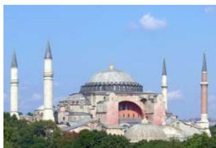
The Haghia Sofia, Istanbul

The 6th century was a golden age for Constantinople. Emperor Justinian reshaped the city and built the Christian cathedral of Haghia Sofia with its huge dome, while glittering mosaics and gleaming marbles lining its walls. By now the Byzantine Empire extended throughout the Mediterranean from the Caucasus to the Atlantic, and from the Danube to the Sahara.