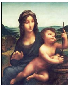
The Madonna with the Yarnwinder by Loenardo da Vinci (ca. 1501-07), taken from Drumlanrig Castle, Scotland,, in 2003

The media promote an image of suave and sophisticated gentlemen art thieves operating in heists with beautiful paintings, elegant locations and connotations of an exotic millionaire lifestyle. The reality is that the art thief is no aristocrat. Stealing fine art and antiques affords criminals with a high value commodity, often poorly protected, difficult (but thankfully not impossible) to identify, that can transcend national or international boundaries and reach those eager to deal with the discreditable and unsuspecting.