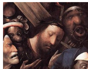
Part of "Christ Carrying the Cross" (1490) by Hieronymus Bosch Museum of Fine Arts, Ghent