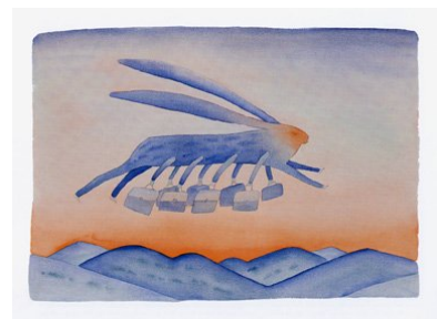
"Au Pays des Merveilles" by Jean-Michel Folon

Our lecture venue: The Church Hall (St.Boniface Anglican Church), Grétrystraat, 2018 Antwerpen Info: 03/230 39 36.