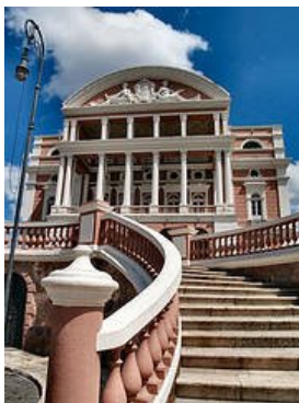
The Opera House at Manaus, Brazil GDB

From then on, new technology like film and radio brought opera to the millions. In the 20 th century the political power of opera was still used by dictators such as Hitler, Stalin and Mussolini. After WWII the record industry, and nowadays the DVD, help to democratize opera. But as relatively few new opera works are composed, the question now is: will opera become a Museum Art, reproducing works from the past, or will it move to a new area, using new forms of multimedia and continuing to attempt to incorporate all the arts in one?