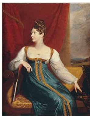
Charlotte Augusta of Wales, Princess Leopold of Saxe-Coburg-Saalfeld by George Dawes

Paying particular attention to the eighteenth century, the lid is lifted on tales of cash for honours, spurned mistresses, ambitious courtesans, mistreated wives and truly eye-popping levels of spending.