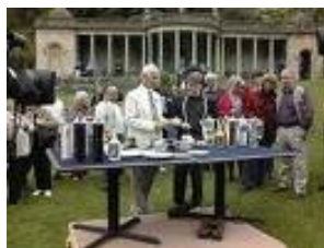
Paul Atterbury at a recent Antiques Roadshow

Collecting the 20th century is both a cultural phenomenon and a popular pastime. The styles that launched the century, Art Nouveau and Art Deco, are well established, but the second half of the century is less familiar in collecting terms. Starting in the 1940s, we are asked to look at the various styles that dominated European taste and fashion until the 1990s, in order to identify what is collected now and what may be collected in the future.