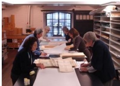
The volunteers at work in the Felixarchives