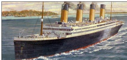
(RMS Titanic, an Olympic-class passenger liner owned by the White Star Line and built at the Harland and Wolff shipyard in Belfast)